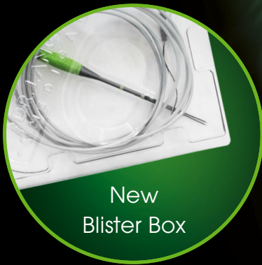
New Blister Box