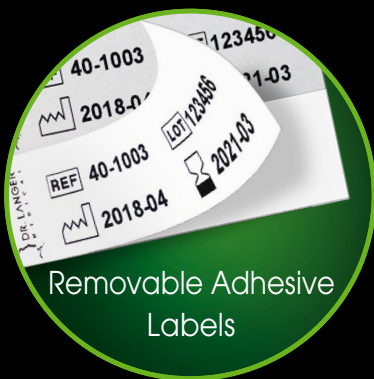
Removable Adhesive Labels